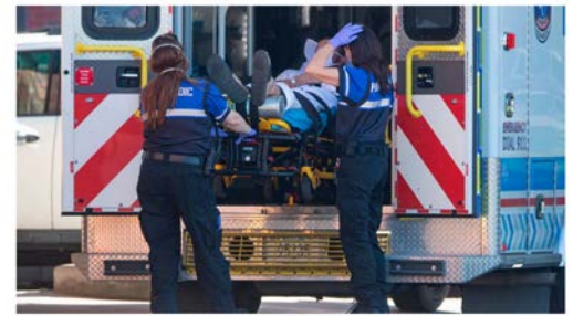
A patient with unknown ailments is unloaded from an ambulance outside of Wesley Medical Center on Thursday, Nov. 19, 2020. Availability of ICU beds in Wichita area hospitals have improved in the last week, but the area remains the worst region in the state for ICU availability.